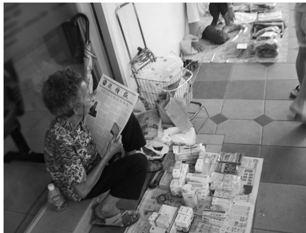
Photo: "Elderly lady reading the Hammer " (from The Workers' Party of Singapore's website)

There are several political party newspapers. Petir , the party organ of the PAP is the most regularly published. Several opposition parties also publish and distribute their own party newspapers— Hammer (Worker's Party), New Democrat (Singapore Democratic Party) and Solidarity (National Solidarity Party). Opposition party publications sometimes only appear intermittently because of party constraints. Opposition party newsletters are not available in news stands and bookshops because their owners usually refuse to carry them. Instead, opposition newsletters are sold through weekly direct sales in residential estates and are also available through subscription. 46